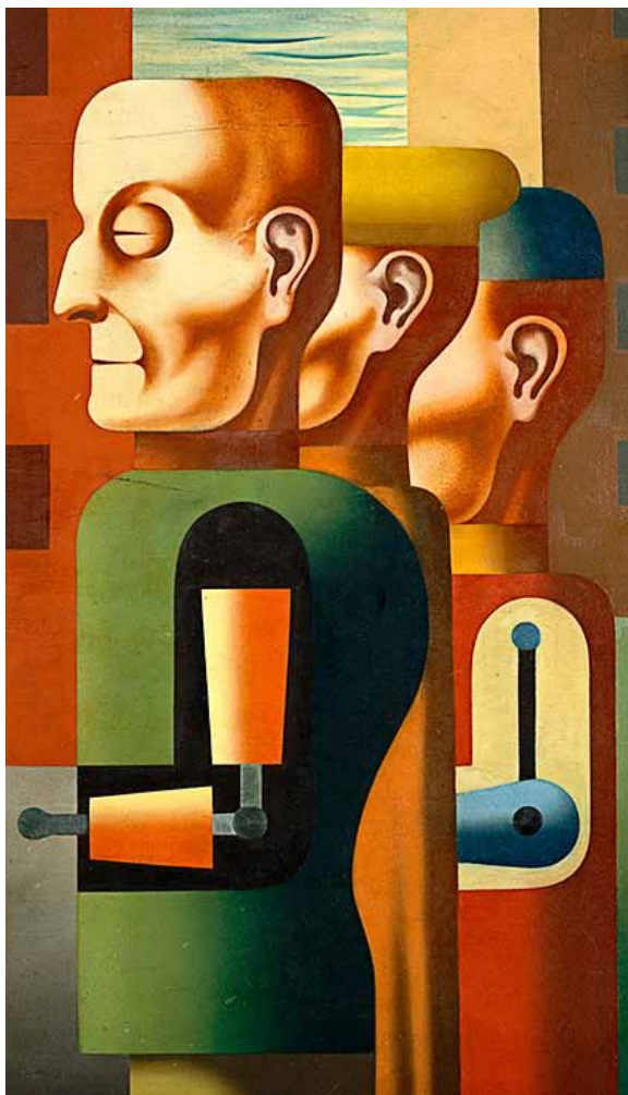
Heinrich Hoerle Three invalids c.1930 (detail) Private collection

In an era of chaos came an explosion of creativity – experimental, provocative and utterly compelling.