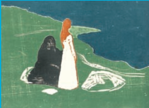
Edvard Munch Two women on the shore To kvinner ved stranden 1898 (detail) . Hand-coloured colour woodcut, 45.5 x 51.3 cm. Munch-museet, Oslo.