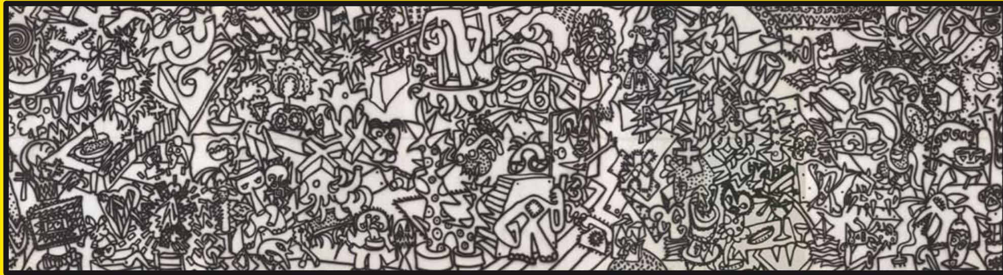
Primitive 1981, Private collection, Melbourne.