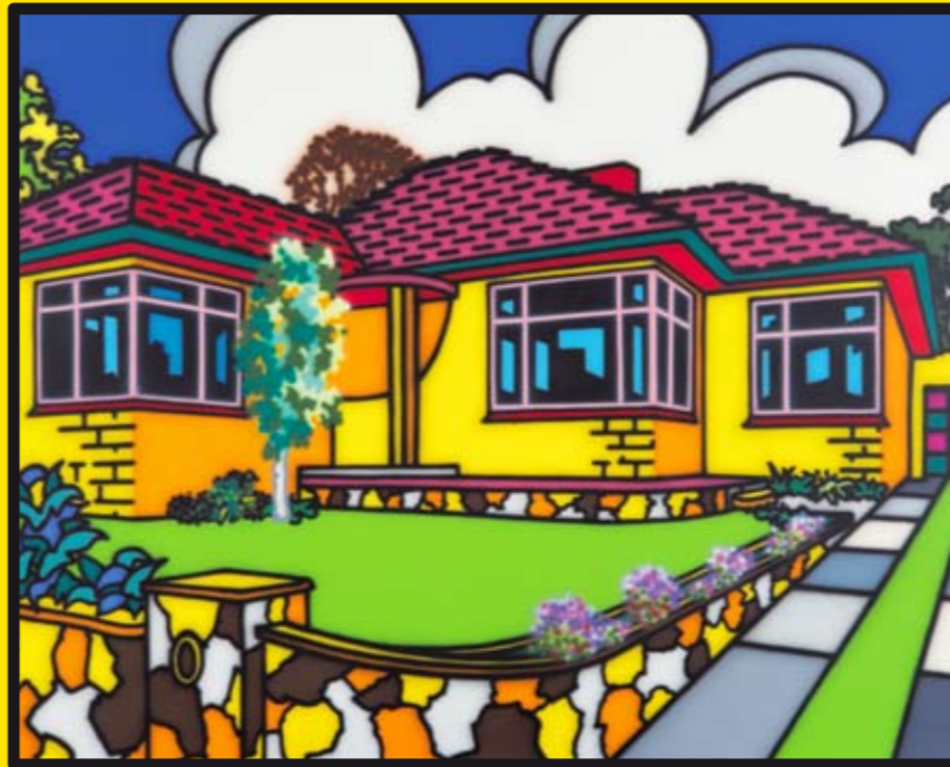
Family home: Suburban exterior 1993. Monash University Museum of Art, Melbourne. Purchased, 1994.

Howard Arkley used pictures from magazines and house advertisements for ideas. He painted with bright colours. He lived in Melbourne. Do you live in a house like this?