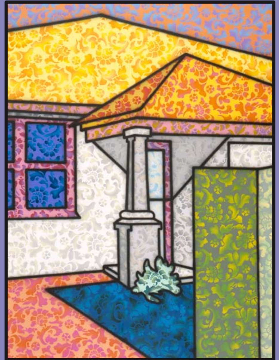
Floriated residence 1994. The Vizard Foundation Art Collection of the 1990s, Melbourne. Acquired 1994. On loan to Ian Potter Museum of Art, the University of Melbourne

Howard Arkley used pictures from magazines and house advertisements for ideas. He painted with bright colours. He lived in Melbourne. Do you live in a house like this?