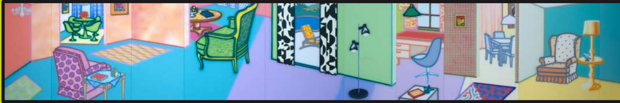
Fabricated rooms 1997-99 Corbett Lyon and Yueji Lyon Collection of Contemporary Australian Art, Melbourne.