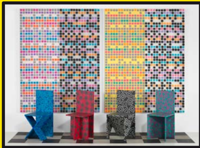
Muzak mural - chair tableau 1980-81 National Gallery of Victoria, Melbourne. Michell Endowment, 1982

Howard Arkley used stencils to create patterns. Sometimes the patterns are geometric. He saw bright lights at the disco.