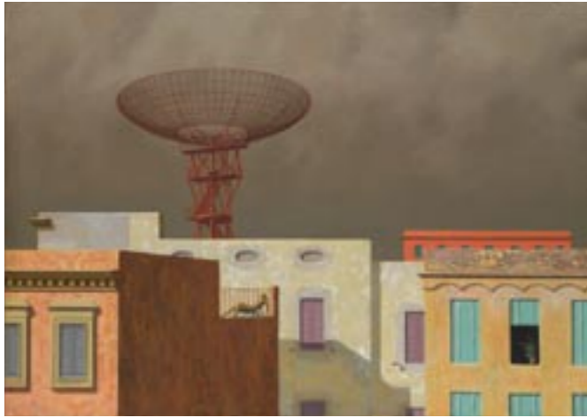
Jeffrey Smart Rooftops (1968-69). Oil on canvas, 71.6 x 100.4 cm.

The artist looked out a window across the roof tops.