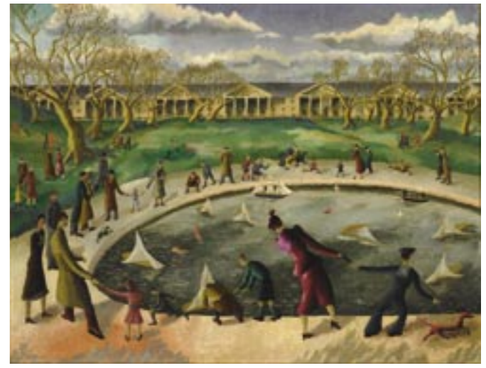
Peter Purves Smith ( The pond, Paris ) (c.1938). Oil on canvas, 71.7 x 92.0 cm

The pond in the park was a popular place for city people to play.