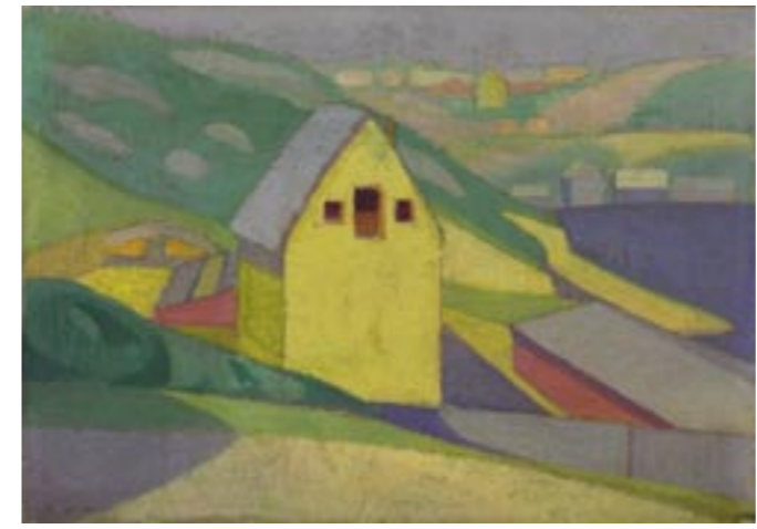
Roy de Maistre ( Synchromy, Berry's Bay ) 1919. Oil on plywood, 25.4 x 35.2 cm. © Courtesy of the artist's estate