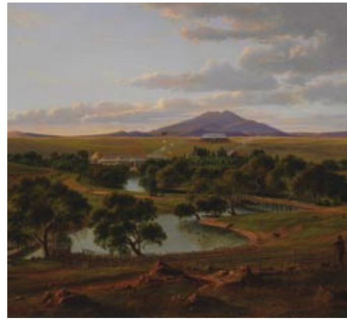
Eugène von Guérard Yalla-y-Poorra 1864. Oil on canvas, 71.6 x 122.4 cm

Yalla-y-Poorra was a farm a long time ago.