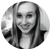
Erin Price Continuous line drawing Haileybury Girls College, Keysborough