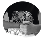
Oliver Reade Amulet Collingwood College, Abbotsford