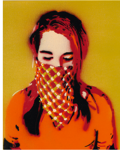
Image caption: Amy Mountjoy No thought control synthetic polymer paint on canvas 30.0 x 30.0 cm East Loddon P-12 College, Dingeeet

"The underlying concept of NGV Studio is that it is a space for exploring and presenting creative processes and VCE Art and Studio Arts are assessed on the finished work as well as the development work. This will be an inspirational resource for current and future VCE art students and presents an insight into the contemporary issues, particularly those of concern to young people," Mr Hurlston said.