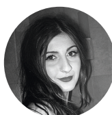
Valona Fiamuri Thalassophobia: Phobias St Columba's College, Essendon