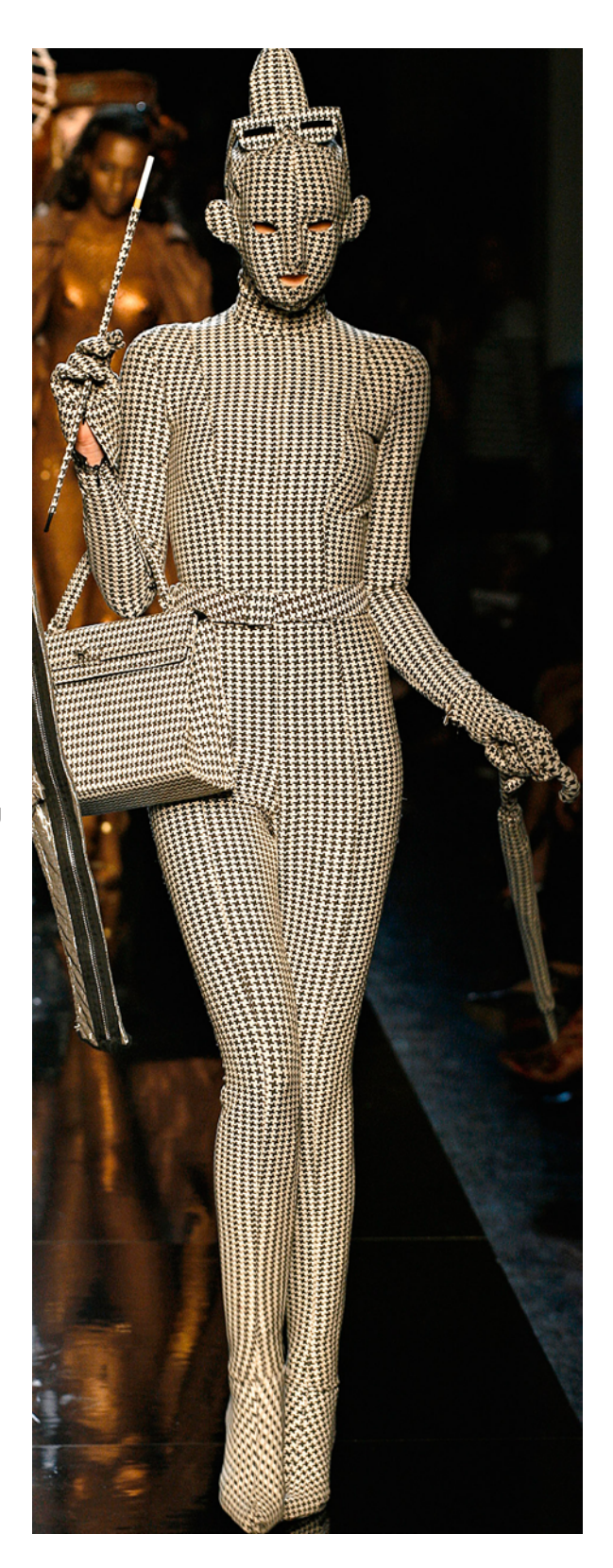
Jean Paul Gaultier French Cancan collection Ready-to-wear, autumn-winter 1991-92

URBAN JUNGLE is where cultures from around the world come together to form a new aesthetic integrated in haute couture. Gaultier mixes and matches multiethnic influences—Bedouin, orthodox Jewish, Chinese, flamenco, Russian, Bollywood and Nordic—in what he refers to as the urban jungle.