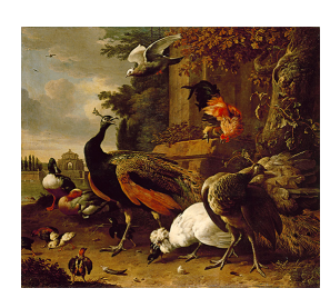
Room 4 Dutch: Peacock and Rooster

Jacob JORDAENS Flemish 1593–1678 Allegorical family portrait (1650s) oil on canvas 178.4 x 152.3 cm The State Hermitage Museum, St Petersburg [Inv. no. ГЭ-485) Prov.: Acquired from the collection of Johann Gotzkowsky, Berlin, 1764