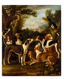
Room 7 Walpole: Magpie

Melchior d'HONDECOETER Dutch 1636–95 Birds in a park 1686 oil on canvas 136.0 x 164.0 cm The State Hermitage Museum, St Petersburg [Inv. no. ΓЭ-1042] Prov.: Acquired from the collection of Jacques Aved, Paris, 1766