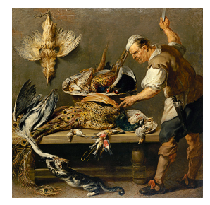
Room 3 Flemish: Pheasant

Alexander ROSLIN Swedish 1718–93 Portrait of Catherine II 1776–77 oil on canvas 271.0 x 189.5 cm The State Hermitage Museum, St Petersburg (Inv. no. ГЭ-1316) Prov.: Acquired from the artist, 1777