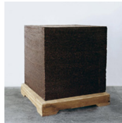
VCE AND IB DIPLOMA