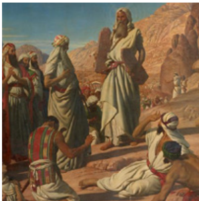
RELIGION AND BELIEF