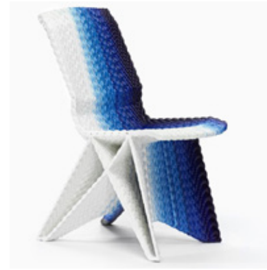
DESIGN AND TECHNOLOGY