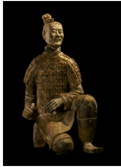
Kneeling archer 跪射俑 Qin Dynasty 221–207 BCE earthenware 120.0 cm Emperor Qin Shihuang's Mausoleum Site Museum, Xi'an (002812)