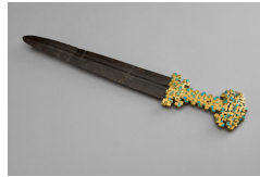
Sword with inlaid hilt 金柄铁剑 Spring and Autumn Period 771–475 BCE iron, gold, turquoise 37.2 (length) cm Baoji City Archaeological Team, Baoji (BYM2:1)