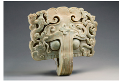
Door ring holder in the form of a mythological beast, Pushou 四神兽面纹玉铺首 Han Dynasty 207 BCE–220 CE jade 35.6 x 34.2 x 14.7 cm Maoling Museum, Xingping (0640)