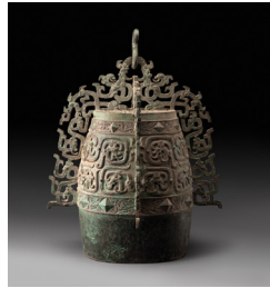
Bell of Duke Wu of Qin, Qin gong bo 秦公钟 (带挂钩) Eastern Zhou Dynasty, Spring and Autumn Period 770–476 BCE bronze 64.2 x 26.2 x 22.4 cm Baoji Bronze Museum, Baoji (02756/IA5.5)