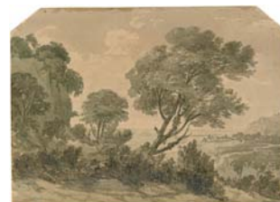
John GLOVER English landscape (c. 1820s) brush and grey-green ink wash 18.4 x 25.6 cm irreg (image and sheet) Purchased, 1961 (799-5)