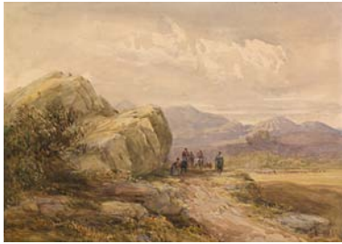
David COX English 1783-1859 A mountain road 1838 watercolour over pencil with some scratching out 23.4 x 33.0 cm Felton Bequest, 1905 (214-2)