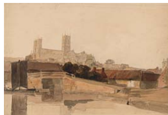
Peter DE WINT English 1784-1849 Lincoln Cathedral (c. 1810) watercolour over pencil 39.7 x 58.7 cm Felton Bequest, 1921 (1206-3)