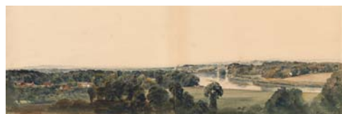
Peter DE WINT English 1784-1849 Christchurch (1843) watercolour over pencil 25.2 x 73.8 cm Felton Bequest, 1923 (1310-3)