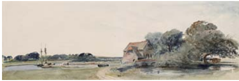
Peter DE WINT Richmond (1843) watercolour over pencil 24.8 x 73.9 cm Felton Bequest, 1923 (1311-3)