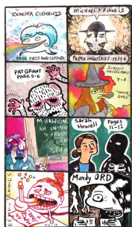
All artwork contained within these pages is the copyright of the above artists.