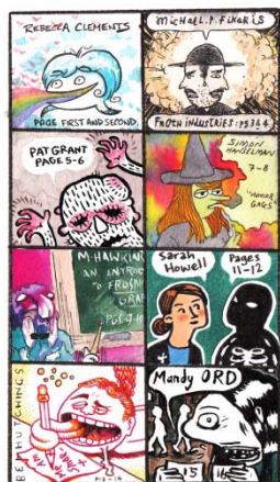
All artwork contained within these pages is the copyright of the above artists.

24 hour drawing marathon, 4-5 August 2011