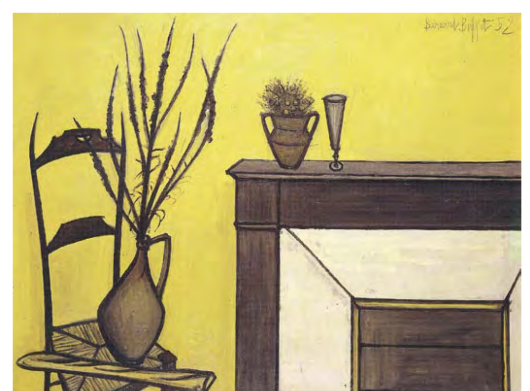
Bernard Buffet French 1928–1999 Still life with fireplace 1952 oil on canvas 114.0 x 146.1 cm The Eugénie Crawford Bequest, 2011