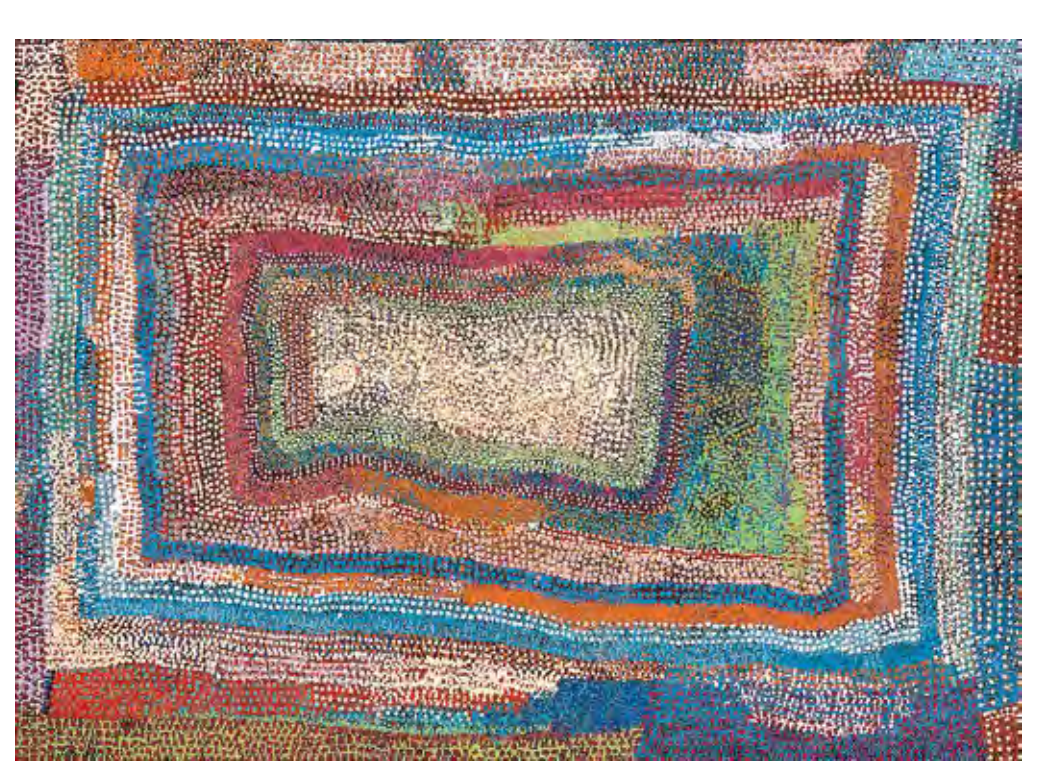
Tommy Mitchell Ngaanyatjarra born c.1943 Kurlilypurru 2009 synthetic polymer paint on canvas 152.0 x 212.0 cm Felton Bequest, 2011 © Tommy Mitchell, courtesy Warakurna Artists Aboriginal Corporation