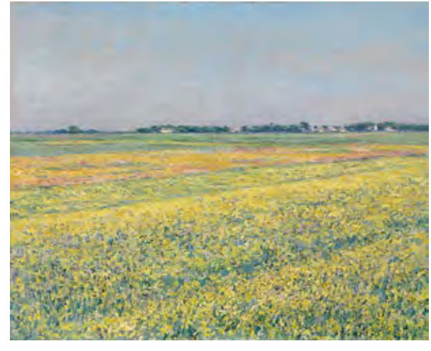
Gustave Caillebotte France 1848–94 The plain of Gennevilliers, yellow fields (La plaine de Gennevilliers, champs jaunes) 1884 oil on canvas 65.5 x 81.5 cm National Gallery of Victoria, Melbourne Felton Bequest, 2011