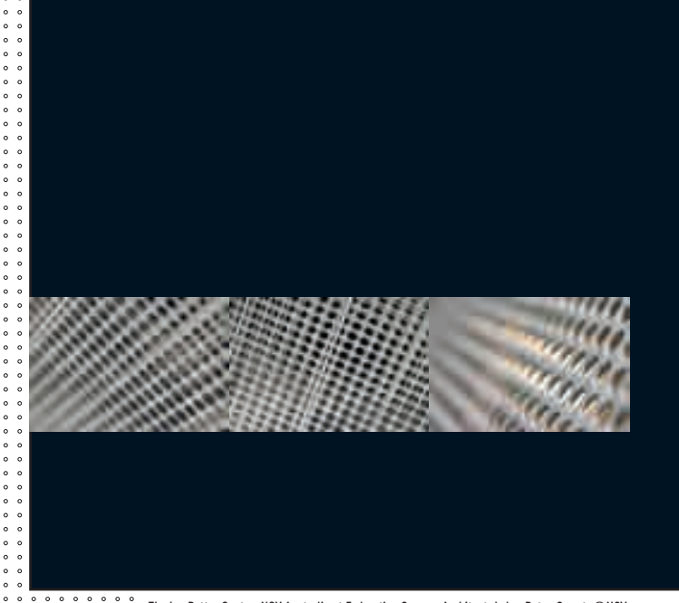
The Ian Potter Centre: NGV Australia at Federation Square. Architect: Lab + Bates Smart. ©NGV

It gives me great pleasure to report that the Melbourne exhibition was viewed by some 483,000 visitors. At each venue, our pictures were received with universal acclaim and enthusiasm; in particular, the show attracted huge attendances in Portland where the exhibition opened shortly after the events of 11 September in New York. Having satisfied ourselves that there was no obvious, increased danger to the pictures remaining in America, and following consultation with the President and Council of Trustees, we took the decision that the tour should continue. This gesture of support from the NGV at such a time of crisis was seen as significant and was enormously appreciated by all concerned. Indeed, our commitment to the tour in the weeks and months following 11 September was a subject of comment in the US press. Overall, the profile not only of the NGV, but also of Melbourne and Victoria, was immeasurably enhanced as a result of the European Masterpieces tour and we look forward to embarking upon other touring shows in the coming years.