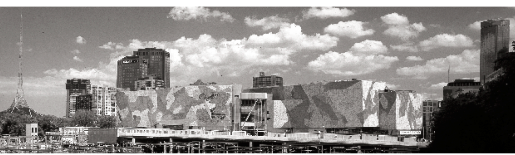
The Ian Potter Centre: NGV Australia at Federation Square. Architect: Lab + Bates Smart. (detail)