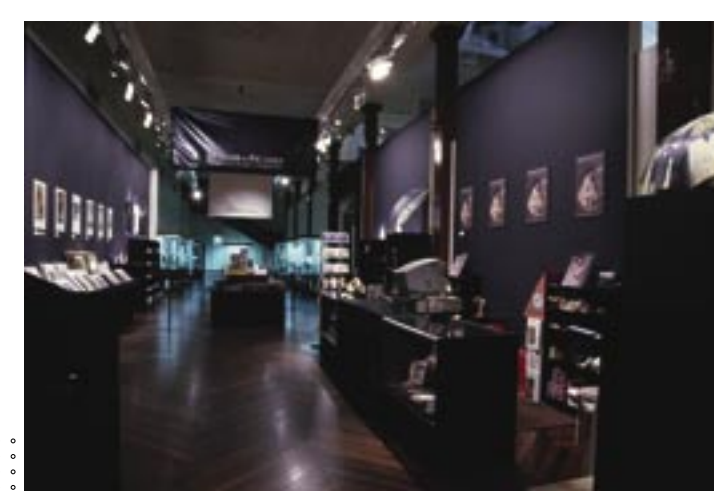
Renoir to Picasso: Masterpieces from the Musée de l'Orangerie, Paris shop

2 May-30 June 2002. Exhibition organized by the NGV, Tiwi Design Aboriginal Corporation and National Exhibitions Touring Support (NETS) Victoria; sponsored by Australia Council for the Arts, Community Support Fund, State Government of Victoria, Northern Territory Government, Department of Communications, Information Technology and the Arts