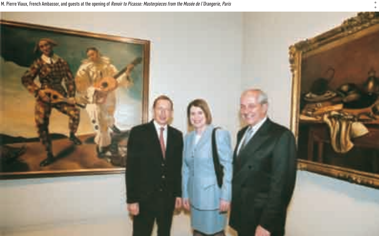
M. Pierre Viaux. French Ambassor, and quests at the opening of Renoir to Picasso: Masterpieces from the Musée de l'Orangerie. Paris

An extensive range of activities, attended by more than 3000 people, were developed. Forty-nine public and nineteen members' programs provided 2010 attendees with a choice of focus from historical context to influences on contemporary arts practice and lifestyle. The 2002 Seniors Festival program featured a tour of the exhibition with Voluntary Guides, an education resource, and refreshments in the members' lounge. A family trail, children's films, music program, visits to Kazari Gallery, the Melbourne Annual Flower Show and the Chinese Museum in Bendigo extended programs beyond the exhibition and the NGV. School programs, attended by 1158 students and teachers, included introductory tours, workshops, exhibition tours and related activities of haiku poetry, calligraphy and ikebana. A master class in calligraphy was presented by artist Patrick Lam. Teacher professional development programs included 'Exploring Asia through the Arts' (a collaborative program in association with the LOTE Unit, Learning and Teaching Innovation Division, DE&T) and 'Dancing with a Chinese Brush—a Western Interpretation', a workshop with artist Elizabeth James introducing the basic principles of Chinese calligraphy.