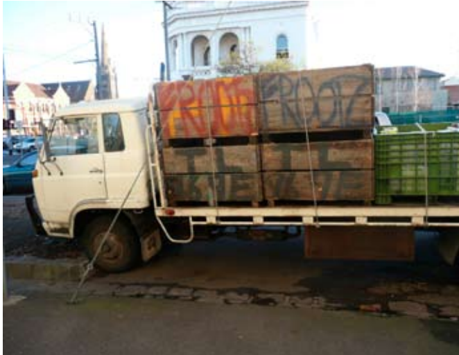
Fruit and vegetable truck.