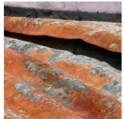
Rusting corrugated iron roof