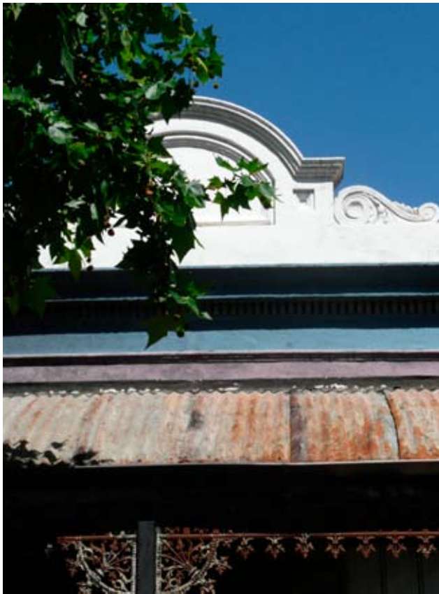
Derelict inner city house.