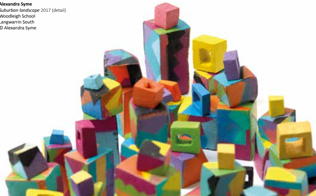
Alexandra Syme Suburban landscape 2017 (detail) Woodleigh School Langwarrin South © Alexandra Syme