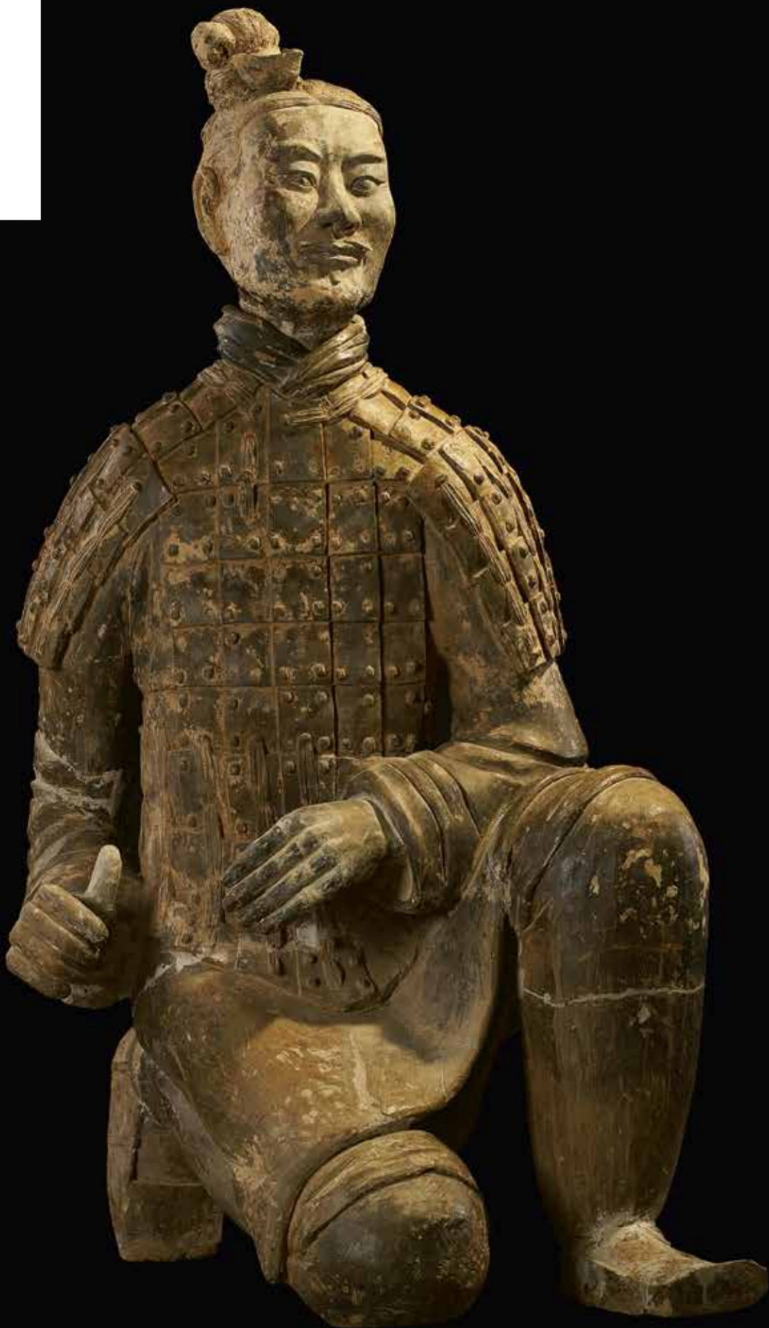
(above) Kneeling archer Qin Dynasty 221–207 BCE, Emperor Qin Shihuang's Mausoleum Site Museum, Xi'an (overleaf left) CHINESE Armoured general, Qin Dynasty 221–207 BCE (detail) Emperor Qin Shihuang's Mausoleum Site Museum, Xi'an (002524) (overleaf right) Portrait of Cai Guo-Qiang, 2009 (detail)