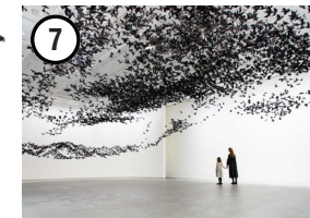
7 Cai Guo-Qiang Murmuration (Landscape) 2019