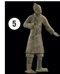
5 Standing Archer 221–207 BCE