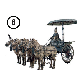
6 Chariot #1 (Qin dynasty replica)