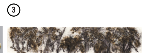
3 Cai Guo-Qiang Flow (Cypress) 2019