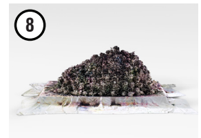
8 Cai Guo-Qiang Transience I (Peony) 2019