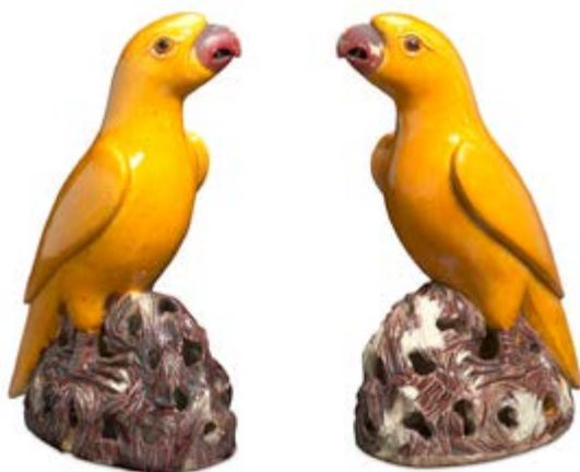
Chinese Pair of parrots Qing dynasty, Kangxi period 1662–1722