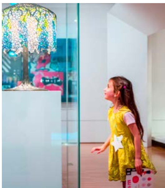
A young explorer discovers the NGV Collection with the Let's Find It! activity sheet Photography taken before COVID-19