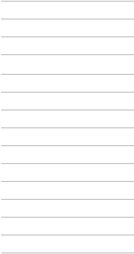
Sophie Yang Imagine How Much More You Could Be 2020 Yarra Valley Grammar, Ringwood © Sophie Yang