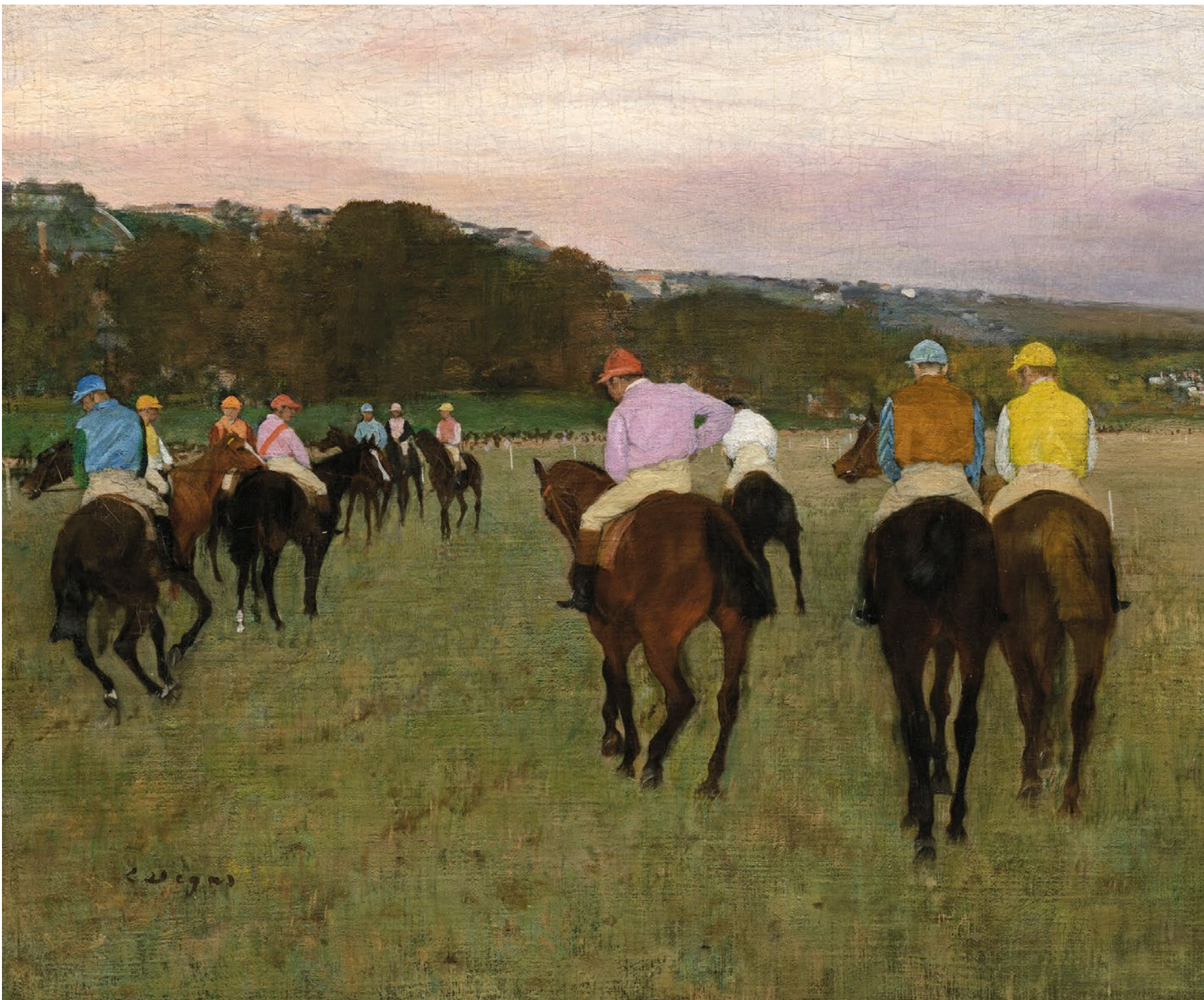
Edgar Degas Racehorses at Longchamp 1871, possibly reworked in 1874 oil on canvas 34.0 x 41.9 cm Museum of Fine Arts, Boston S. A. Denio Collection—Sylvanus Adams Denio Fund and General Income (03.1034)