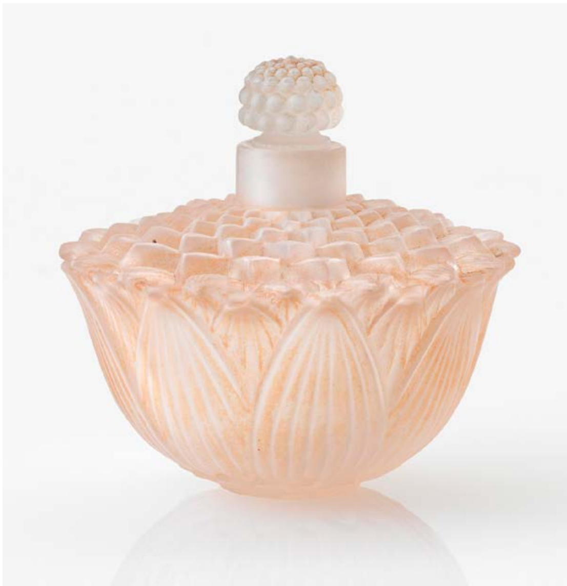
R. Lalique. Wingen-sur-Moder (manufacturer), Camille , scent bottle, designed 1927, manufactured 1928–37, National Gallery of Victoria, Melbourne.

A bottle is made to hold liquids and usually has a lid or cap to stop the liquid from spilling. Some bottles can be made with a vegetable called a gourd or from animal skin. They can also be made of glass, crystal or stone.