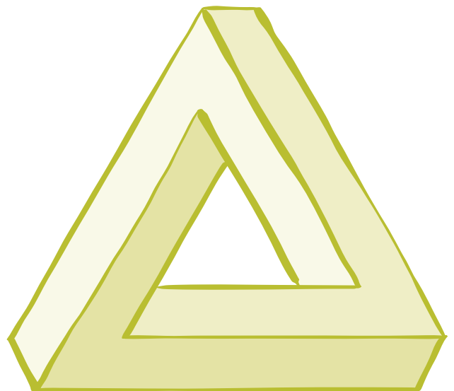
4 Is this triangle possible?