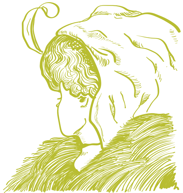
2 Old woman or young woman?