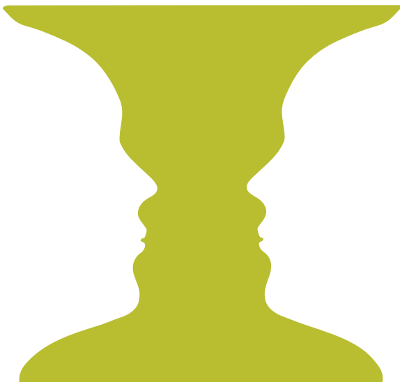
3 Faces or a vase?