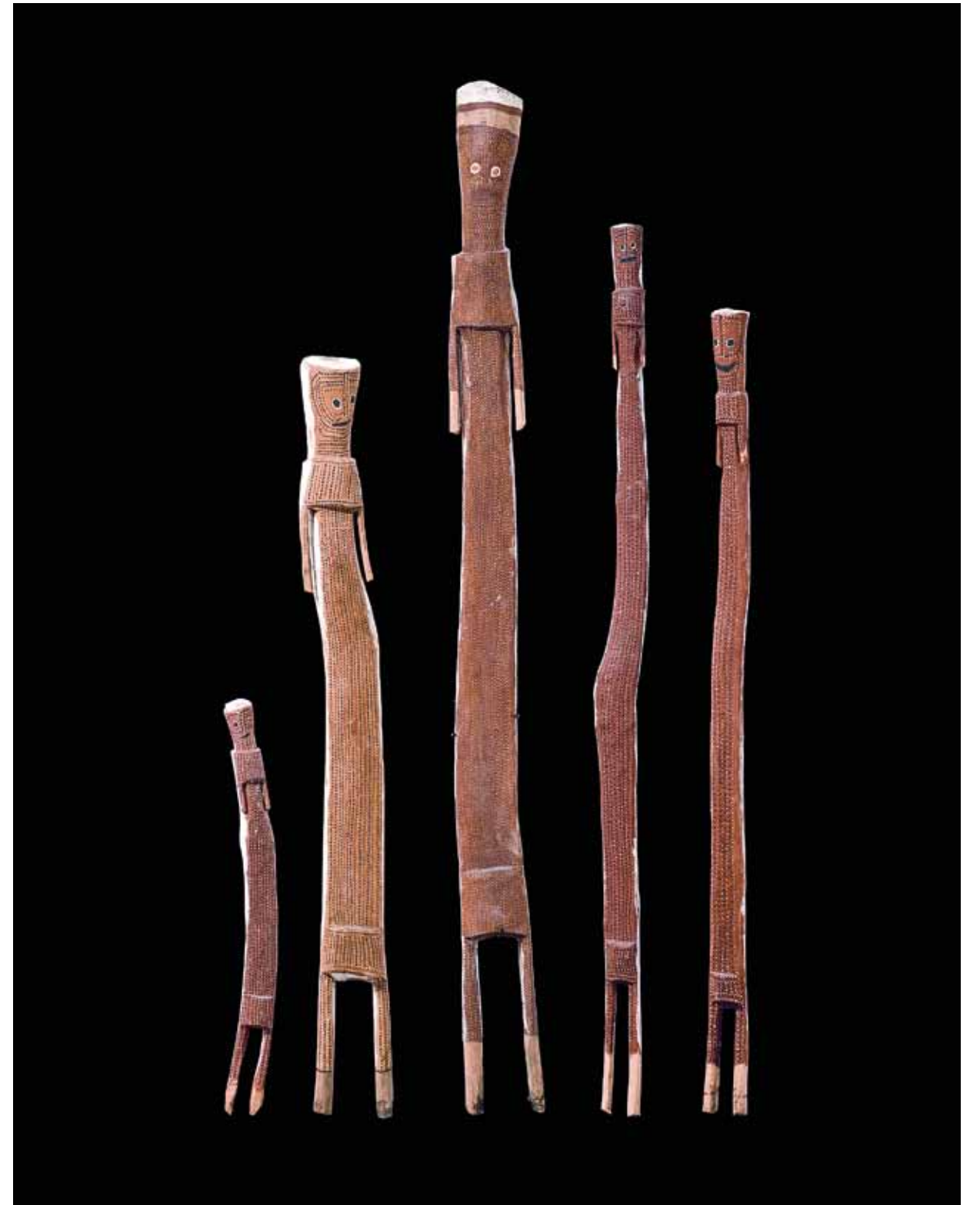
Crusoe Kuningbal Kuninjku c.1922–84 Mimih spirits 1979 earth pigments on wood Purchased, NGV Supporters of Indigenous Art, 2011 © Crusoe Kuningbal/Licensed by VISCOPY, Sydney