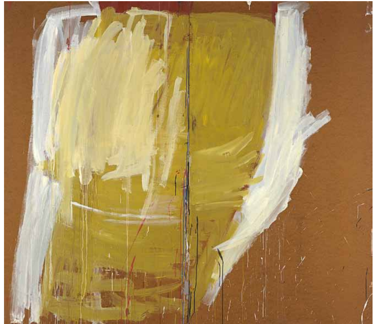
Tony Tuckson born Egypt (of English parents) 1921, arrived Australia 1942, died 1973 Untitled - Yellow (1970–73) synthetic polymer and enamel paint on composition board Loti & Victor Smorgon Fund, 2011 © Tony Tuckson/Licensed by VISCOPY, Sydney