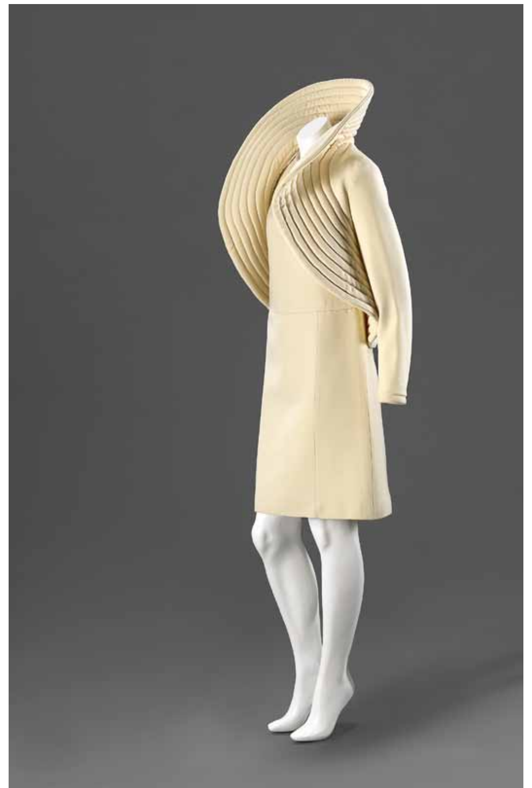
Pierre Cardin, Paris fashion house (est. 1950) Pierre Cardin designer born Italy 1922, emigrated to France 1926 Jacket and mini dress ensemble 1969 wool, acetate (lining) Purchased with funds donated by Bulgari Australia Pty Ltd, 2012