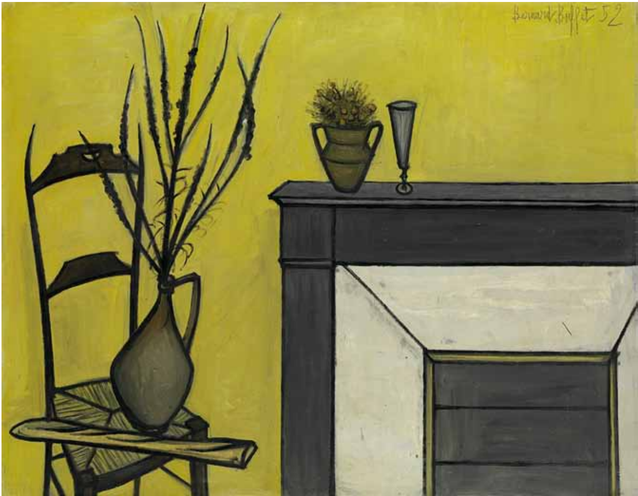
Bernard Buffet French 1928–99 Still life with fireplace (Nature morte à la cheminée) 1952 oil on canvas The Eugénie Crawford Bequest, 2011