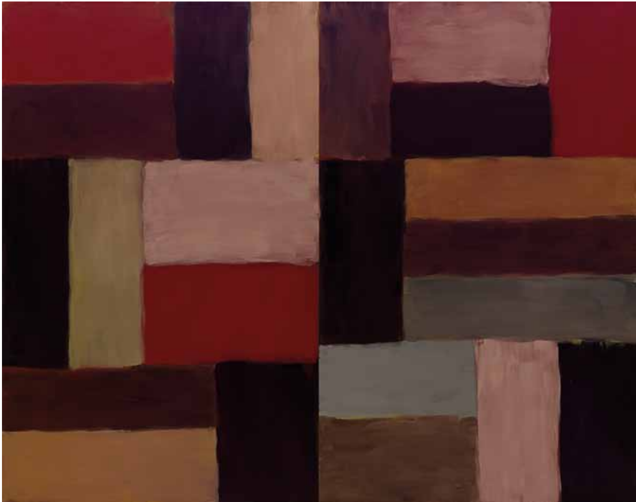
Sean Scully Irish/American 1945– Queen of the night 2008 oil on canvas Purchased NGV Foundation with the assistance of Greg Woolley and NGV Contemporary, 2011 © Sean Scully. Courtesy Galerie Lelong, New York