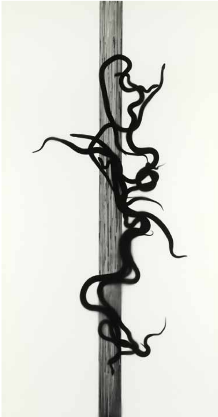
Adam Fuss English 1961–, emigrated to Australia 1962, worked in United States 1982– Caduceus (2010) from the Home and the world series 2010 gelatin silver photograph on canvas Bowness Family Fund for Contemporary Photography, 2011