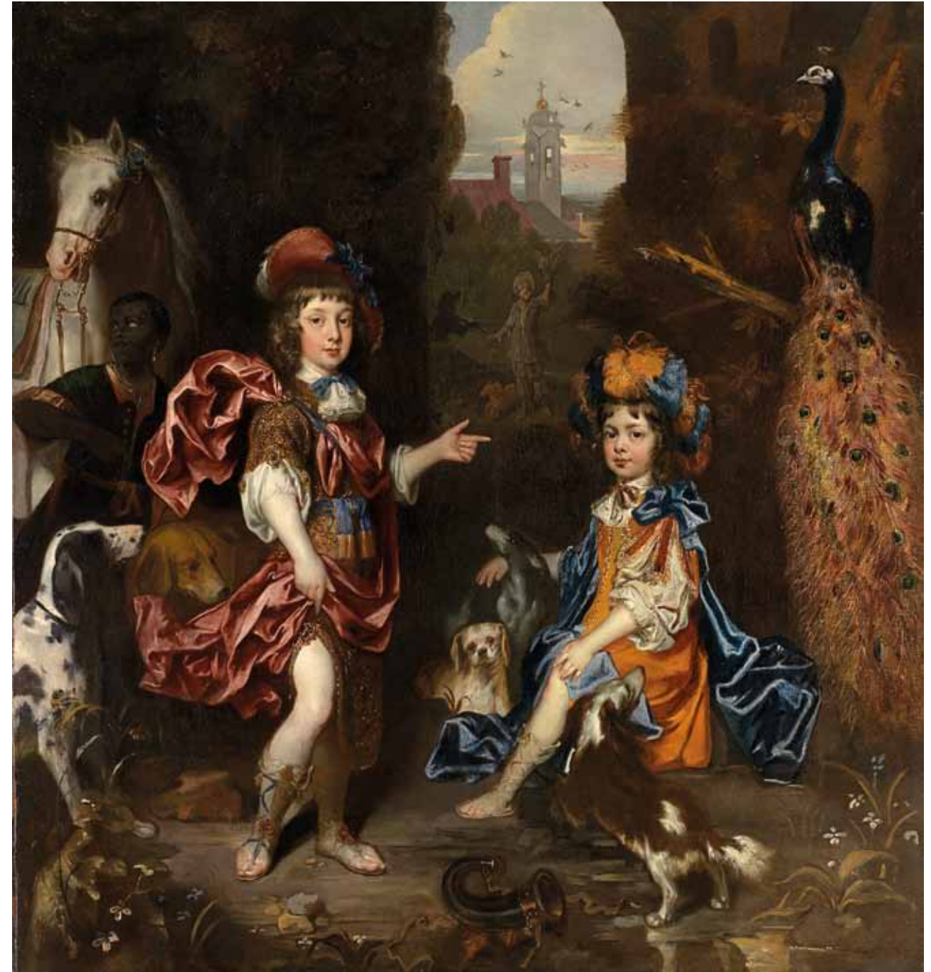
Jacob Huysmans Flemish c.1630–c.1696, worked in England c.1660–96 Edward Henry Lee, First Earl of Litchfield, and his wife, Charlotte Fitzroy, as children 1674 oil on canvas Presented by Montah Holdings Pty Ltd through the Australian Government's Cultural Gifts Program, 2012