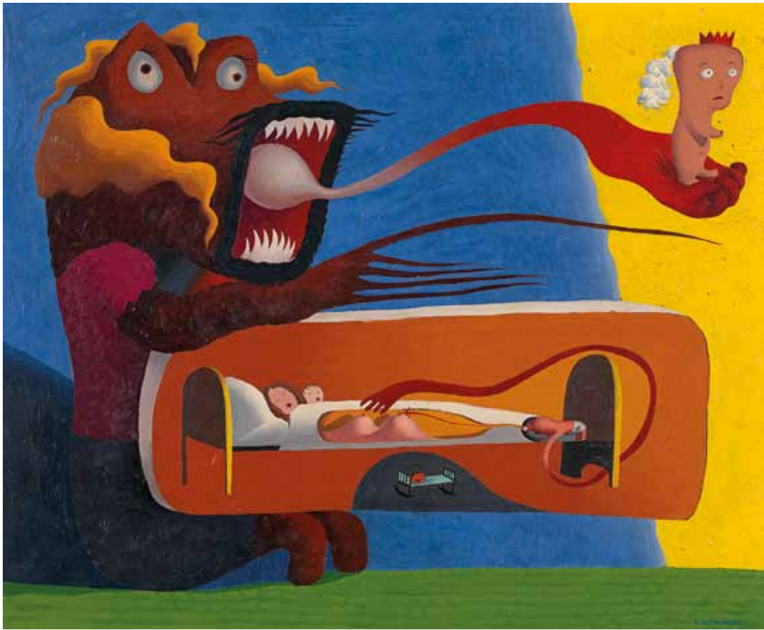
Reuben Mednikoff English 1906–72, worked in United States and Canada 1940–46 October 17, 1938. 10a.m. (The king of the castle) 1938 oil on composition board Purchased NGV Foundation with the assistance of the Duncan Elphinstone McBryde Leary Bequest, 2011 © Reuben Mednikoff Estate