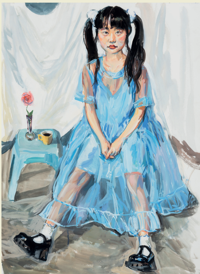
Archer Davies Tulle Blue 2020

Use this guide, a few pieces of paper and a soft lead pencil to draw a subject's face from life. You may choose to draw a friend or use a mirror to create a self-portrait.