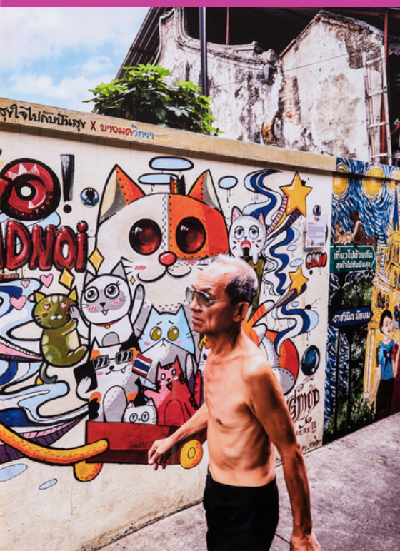
Darcy Bourke The Forgotten And Prevailing , 2023 © Darcy Bourke