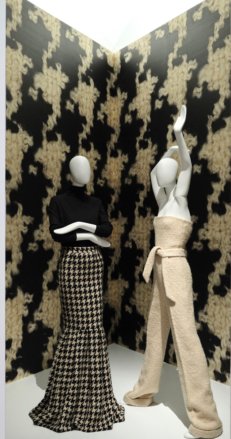
Installation view of Martin Grant 2025 featuring Look 6 sweater and skirt, 2006 (opposite left)

Look 2 , jumpsuit 2006 is notably small, and the mannequin pose—with arms raised above the head—results in a relatively broad back. If the display required the work to be viewed from all angles, a smaller mannequin would have been necessary to maintain a proper fit. However, since the garment is only visible from the front, the conservation team were able to employ a discrete solution: cotton tape was threaded through the hook and eye closures at the back, mimicking a corset-style lacing. This approach maintained the silhouette without placing stress on the fabric or making any permanent alterations. This is just one of several conservation display techniques used in the gallery to ensure each piece is presented beautifully, while remaining fully protected.